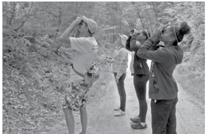
Vernon Greenways Volunteers search for invasive beetles.

run by volunteers. The Vernon Volunteers' Collaborative (VVC) supports these organizations by helping people learn what is available and how they can get involved. The 12 organizations participating in VVC depend on volunteers at every level. Learn about the organizations and volunteer opportunities on our website www.vernonvolunteers.org .