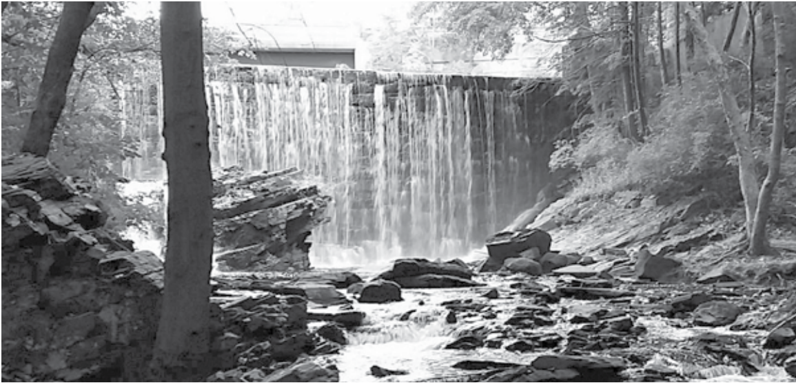
Falls along Talcott Ravine trail off Dobson Road in Vernon

Are you familiar with the non-profit Northern Ct. Land Trust organization serving Vernon, Ellington, Somers, Stafford, Enfield, and East Windsor? You should be, as they are watching out for opportunities to protect and preserve open spaces in your area, and for your enjoyment.