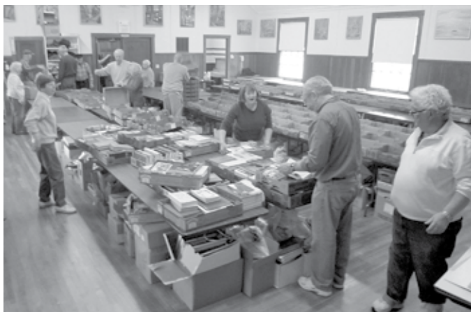
Sorting books for the Vernon Historical Society's annual sale.

What makes Vernon special and gives us our unique character are our open spaces, hiking trails, gardens and parks; our industrial and agricultural heritage; and developing and showcasing the arts. Most of these are thanks to nonprofit organizations